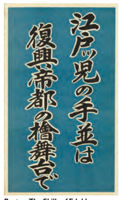
Poster: The Skills of Edokko (People Born in Edo) Are Demonstrated in the Arena of the Restored Imperial Capital End of Taishō period