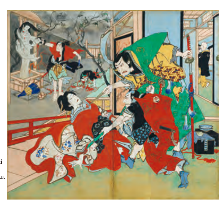
Banshū Sarayashiki Tetsuzan Shimoyashiki