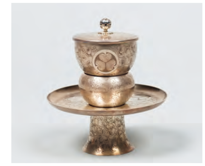
Teacup and Teacup Stand with Aoimon and Yogikumon Crests, and Design of Paulownia Flower Arabesque End of edo period