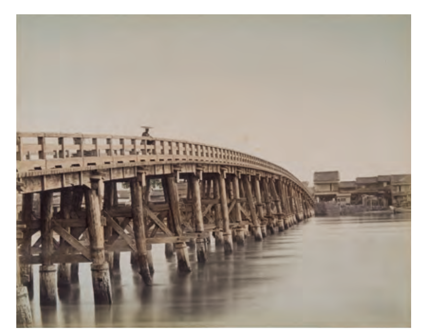
Photograph: Eitaibashi Bridge Early Meiji period

We hope you enjoy our diverse and rich collection, which ranges from primary documents that unveil the history of (Awaya Tomoko, curator) Edo-Tokyo to materials that were close to people's everyday life.